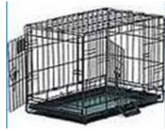
Example of an approved cage.